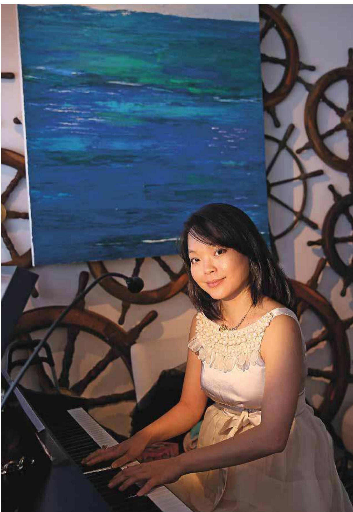
BOTTOM: Liang will be composing the soundtrack to the Poesy animated short herself