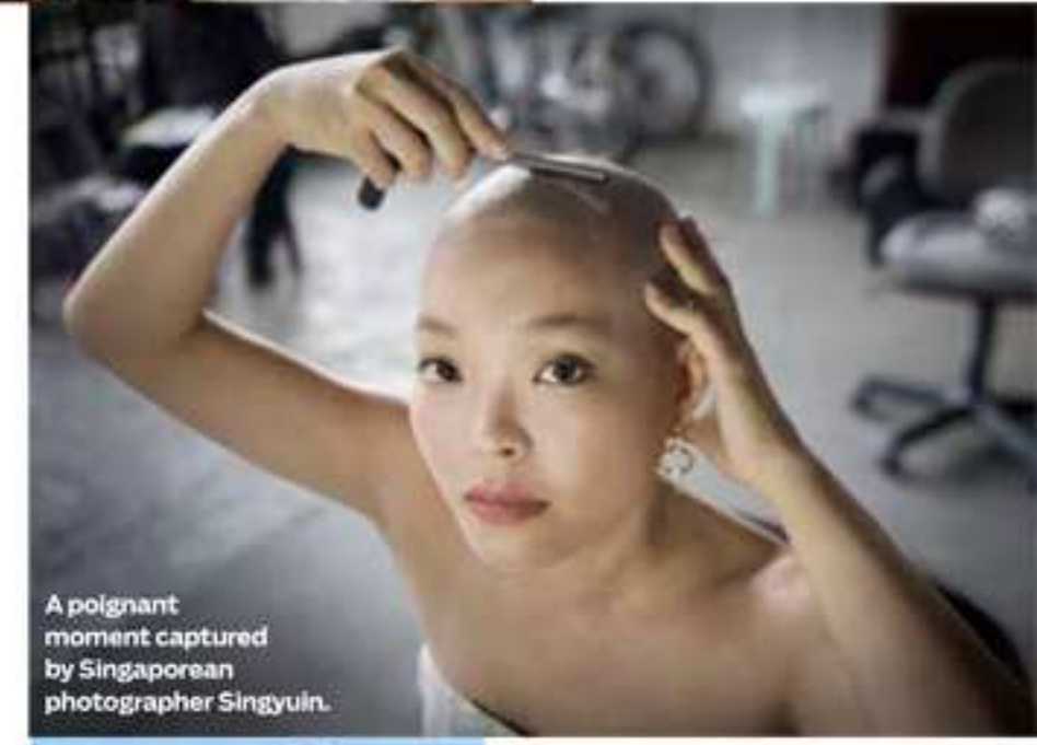
A poignant moment captured by Singaporean photographer Singyuin.

In my own brushes with fate, I have suffered from paralysis twice in my life and am now partially disabled due to not having sensations in my legs. But during my travels, I met many kind folks who did not know who they were helping but helped me anyway. That's empathy.