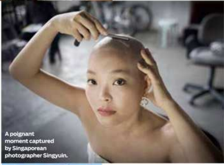
A poignant moment.

In my own brushes with fate, I have suffered from paralysis twice in my life and am now partially disabled due to not having sensations in my legs. But during my travels, I met many kind folks who did not know who they were helping but helped me anyway. That's empathy.