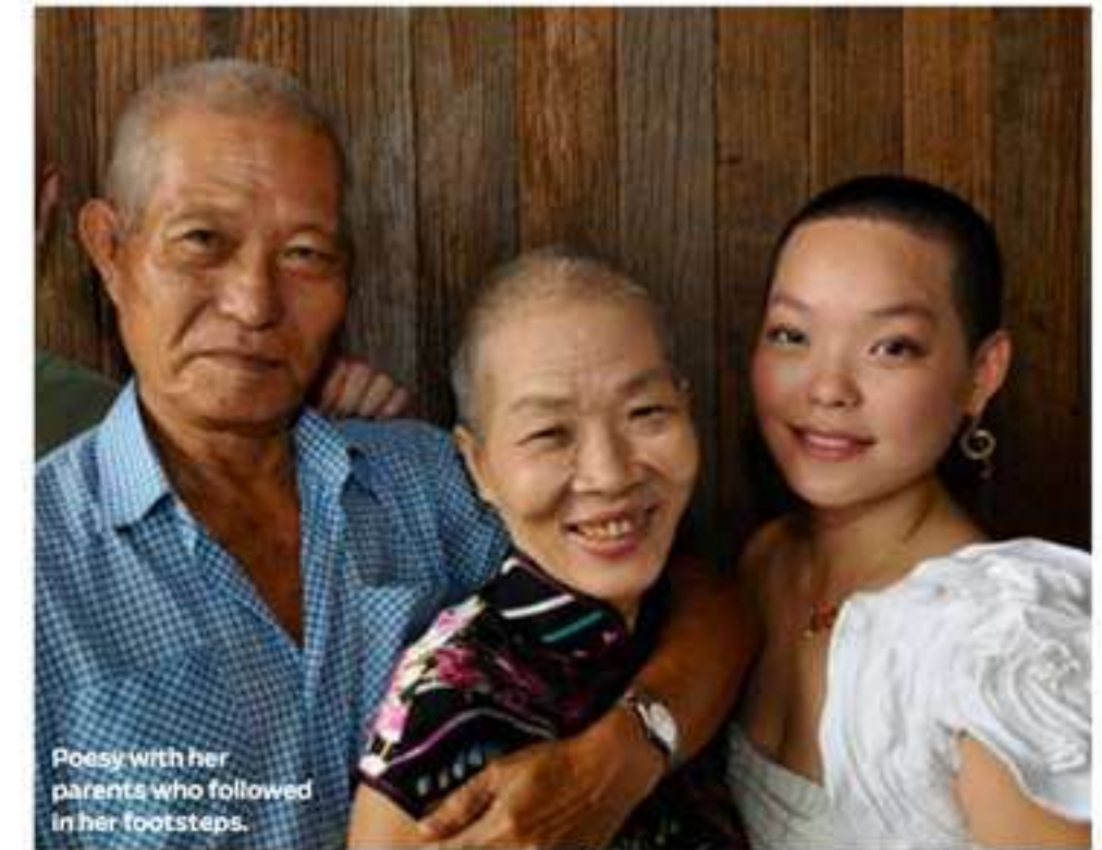
Poesy with her parents who followed in her footsteps.

Because empathy can help the movement reach its five objectives 1. To make baldness fashionable as an empathy movement for those suffering from loss of dignity and hair