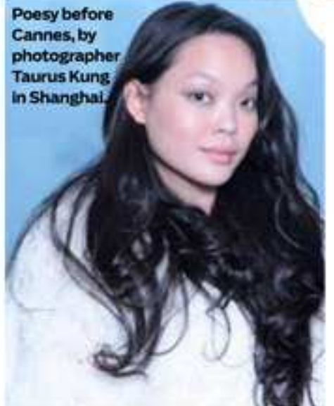
Poesy before Cannes, by photographer Taurus Kung in Shanghai.

"One of our objectives is to make baldness fashionable as an empathy movement for those suffering from loss of dignity and hair loss due to chronic illnesses."