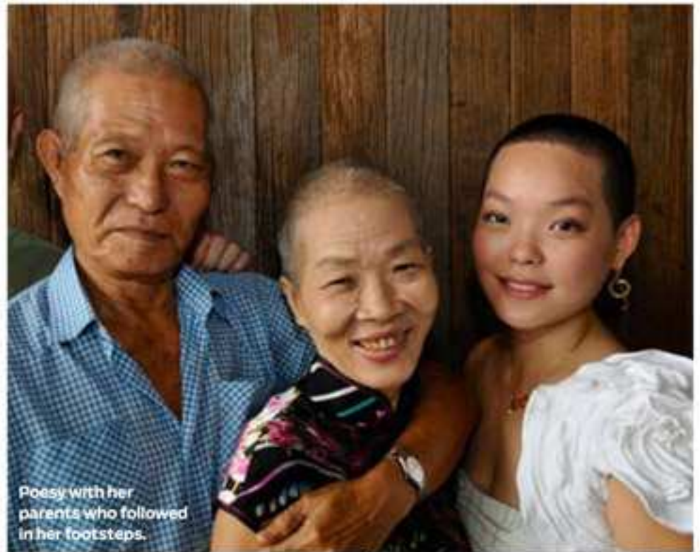
Poesy with her parents who followed in her footsteps.

Because empathy can help the movement reach its five objectives 1. To make baldness fashionable as an empathy movement for those suffering from loss of dignity and hair