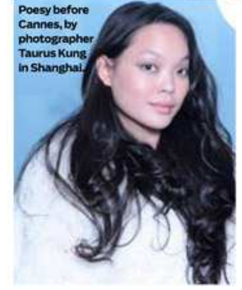
Poesy before Cannes, by photographer Taurus Kung in Shanghai.

"One of our objectives is to make baldness fashionable as an empathy movement for those suffering from loss of dignity and hair loss due to chronic illnesses."