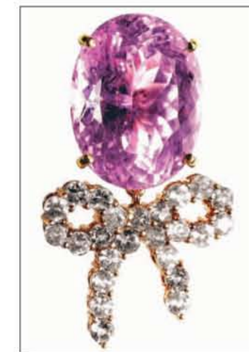
A Pretty Bow earring with kunzite and diamonds on rose gold.