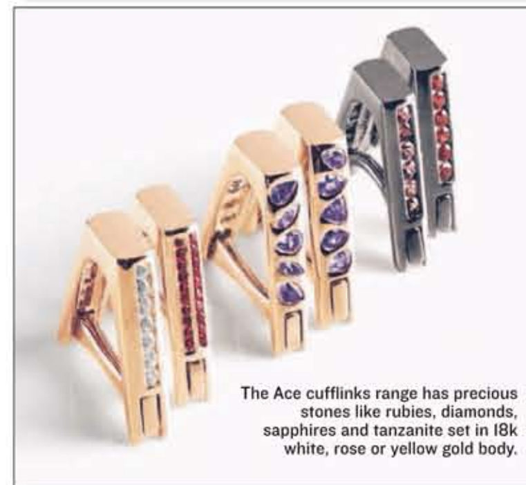
The Ace cufflinks range has precious stones like rubies, diamonds, sapphires and tanzanite set in 18k white, rose or yellow gold body.

project, in 2004, was a kitchen belonging to one of the partners of the legal firm she once worked at.