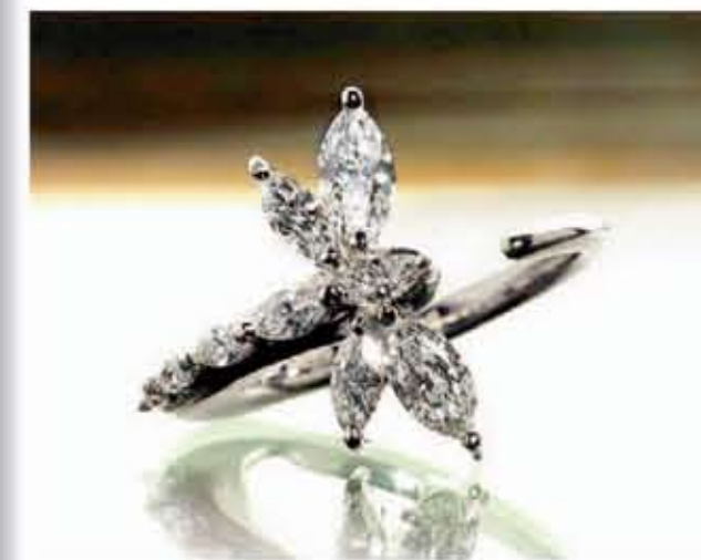
A diamond-studded dragonfly that curls around the finger forms the Dragonfly ring, which comes with matching earrings. There are limited edition versions in tanzanite on white or rose gold.