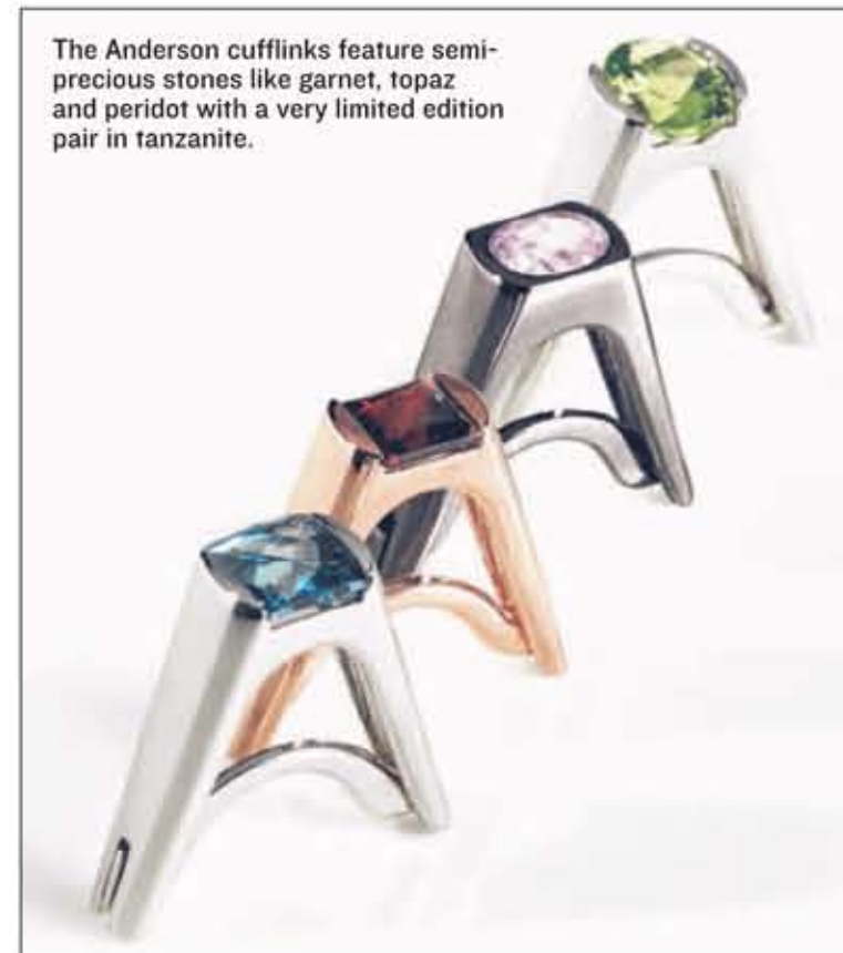
The Anderson cufflinks feature semi-precious stones like garnet, topaz and peridot with a very limited edition pair in tanzanite.

That was when she decided to try her hand at interior design. Her first