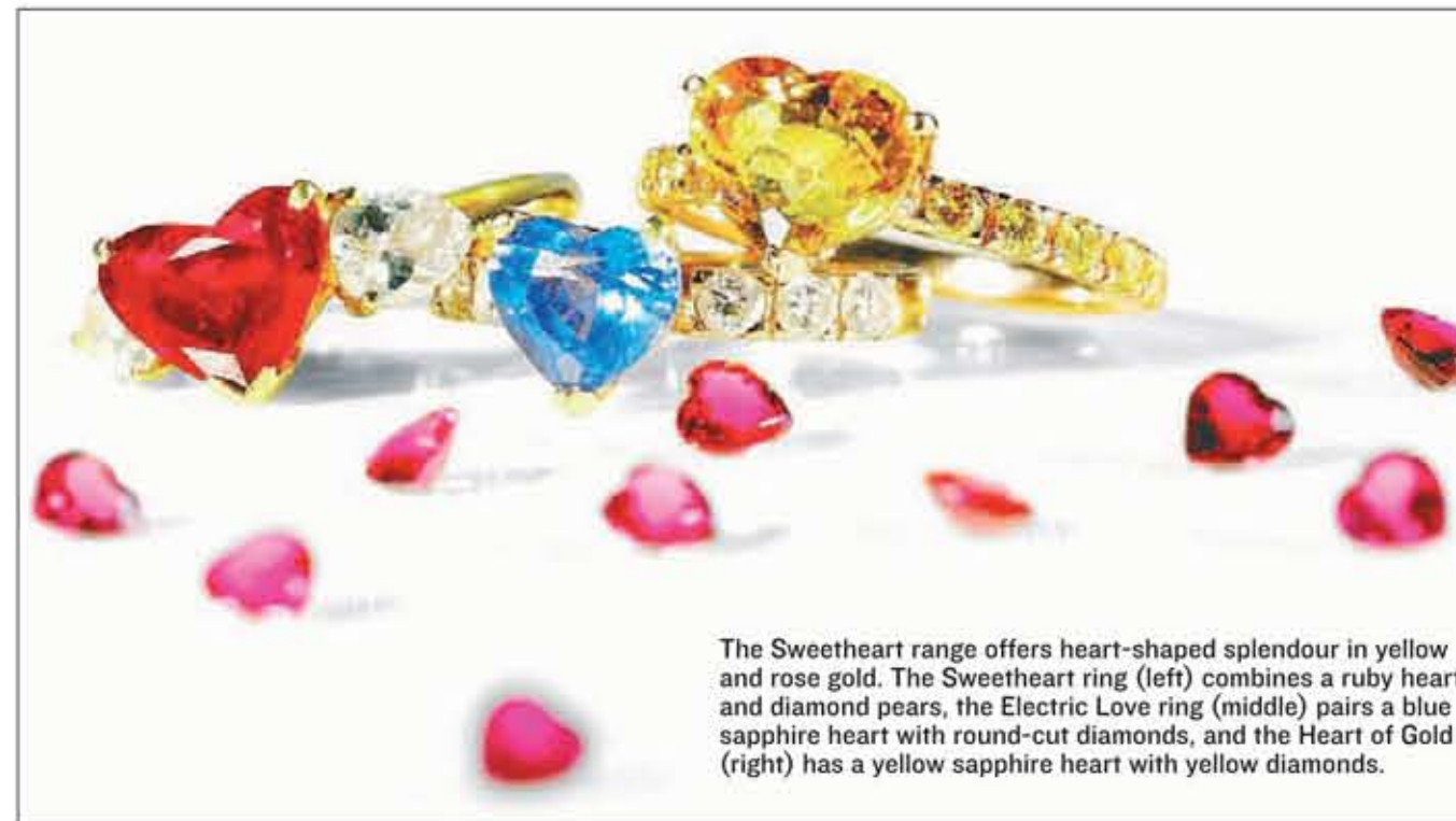
The Sweetheart range offers heart-shaped splendour in yellow and rose gold. The Sweetheart ring (left) combines a ruby heart and diamond pears, the Electric Love ring (middle) pairs a blue sapphire heart with round-cut diamonds, and the Heart of Gold (right) has a yellow sapphire heart with yellow diamonds.