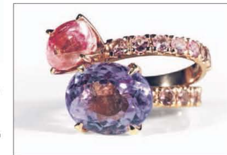
Below: The Pinker Debutante ring (top) has pink tourmalines on rose gold while the Grape Delight right (bottom) features a rare-coloured amethyst flanked by pink tourmalines on rose gold.